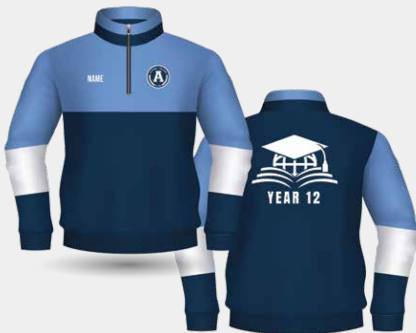
1/4 Zip Jumper

Enquire for more styles, designs and embellishment options!