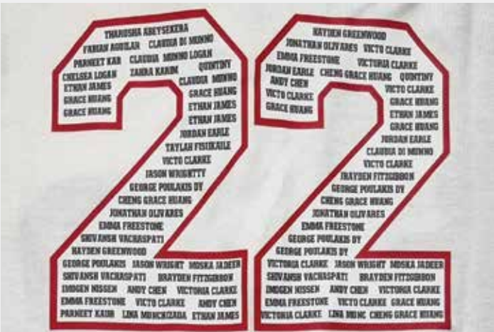
VINYL HEAT PRESSED