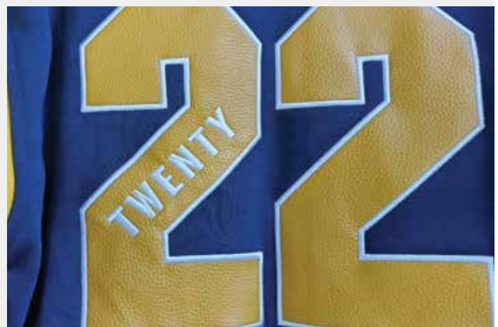
FAUX LEATHER APPLIQUE