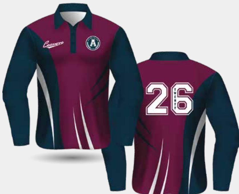
Long Sleeve Polo