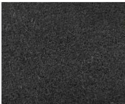
HEAVY WOOL 55% Polyester / 45% Wool